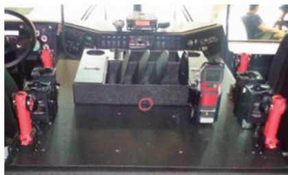
Custom map book holders