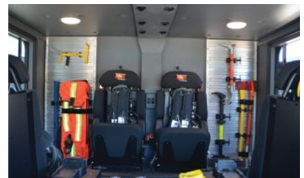
Custom wall equipment storage