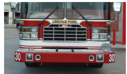
Frame Rail Front Bumper