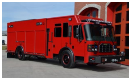
Black out package