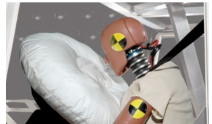
CAP+ Complete Airbag Protection System