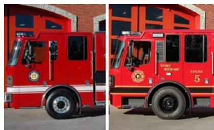
Barrier cab doors