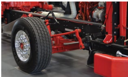
F-Shield Corrosion Protection