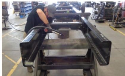
Double and triple channel, heat treated frame rails