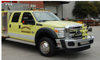
Front bumper monitor