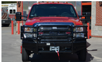
Front grill guard