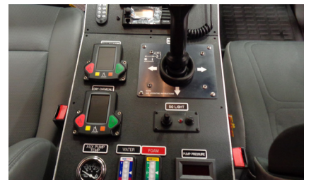
Custom console with pump controls