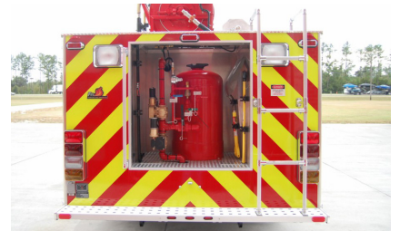
Dry chemical station