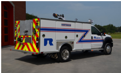
Foam storage and nozzle