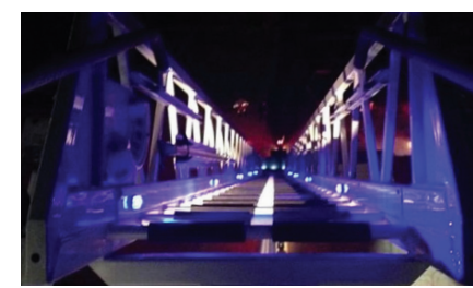
Well-lit ladder rungs for safe and easy night operations