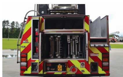
Optional recessed magnet in the auxiliary pad for connecting to the stabilizer foot pad