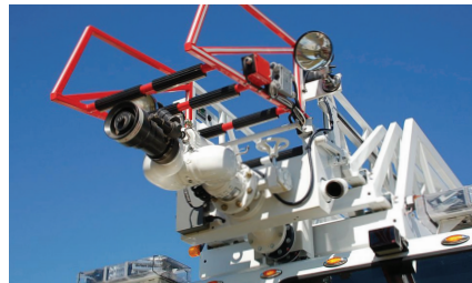
Supply a standpipe without disconnecting the nozzle optional 2-1/2" discharge at the ladder tip