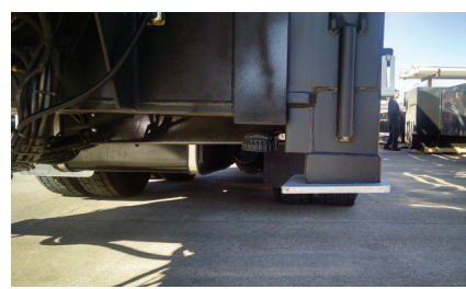
Stabilizer foot pads are angled slightly down toward the middle of the truck