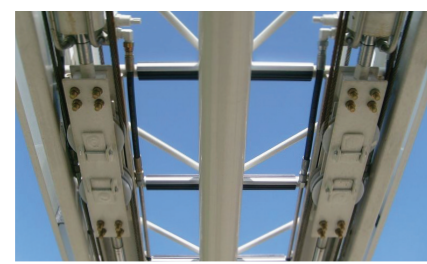
Extension/retraction is smooth and rapid with our dual Siamese extension cylinders