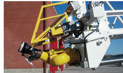
Quickly put out a fire in an attic or upper void area with our optional 165 vertical travel monitor