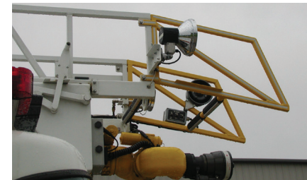
Standard 11° angled, bolt-on egress section for easy transition to a window or roof