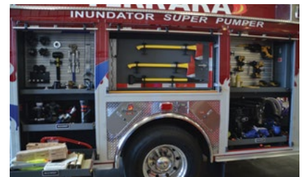
Custom Compartment Storage Solutions