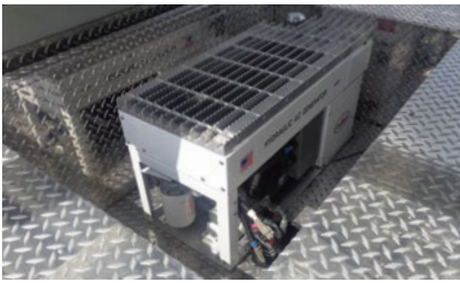
Hydraulic Generator System: Smart Power, Harrison, or Onan