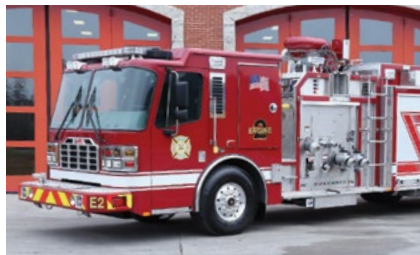
Two Man Rescue Cab with Transverse Storage Compartment