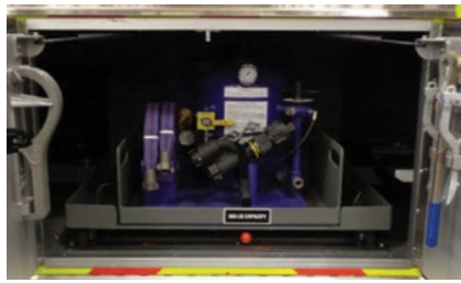
Williams Powder Keg 75lb. Portable Dry Chem System