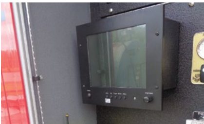
Sidewinder Thermal Imaging Camera System