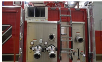
Ziamatic QuicLadder Access System