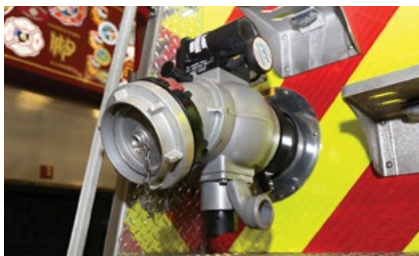
Rear Inlet / Outlet Connections with remote controlled TFT Jumbo Ball Valves