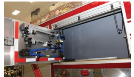
Hinged Tool / Fitting Storage Board Systems