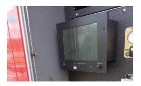
Sidewinder Thermal Imaging Camera System