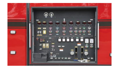
Open or enclosed rear pump control panel