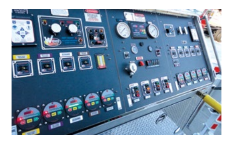
Available Top Mount Controlled Rear Mount Pump Configuration