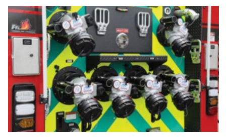
Remote Control Task Force Tips Low Profile Jumbo Ball Intake Valves