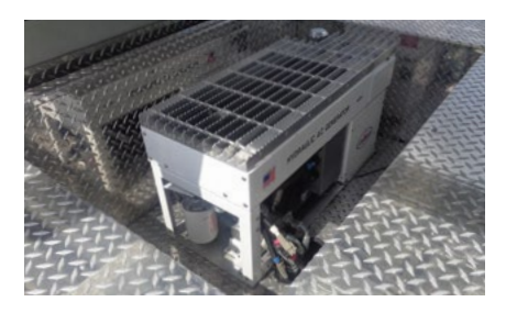
Hydraulic Generator System: Smart Power, Harrison, or Onan