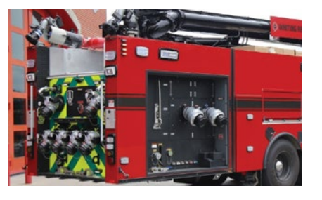
Dual 8" NST LDH Discharges