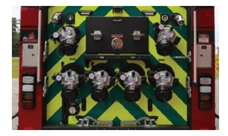
Rear Inlet / Outlet Connections with remote controlled TFT Jumbo Ball Valves