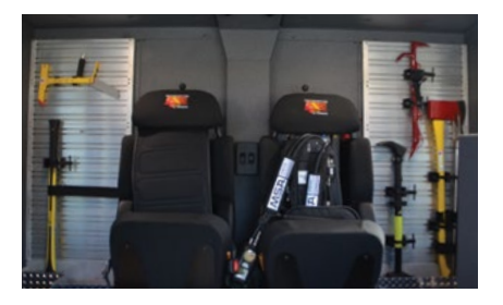
Rear Cab Wall Tool Storage Systems