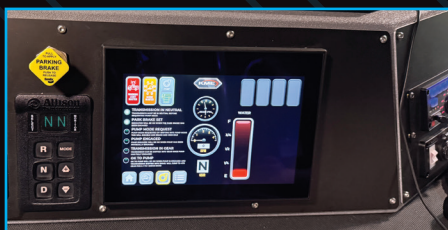
10" LCD touch-screen, wide-view display

User-friendly, modern, automotive-style screens put information and control at your fingertips.