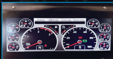
Digital dash display