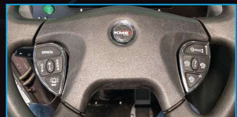
Smart Wheel controls